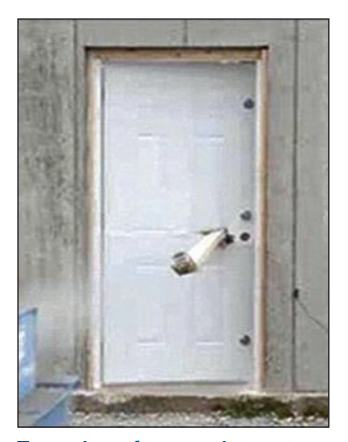
Tornado safe room impact test results: Door assembly failed when perforated