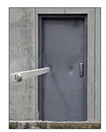
Tornado safe room impact test results: Door assembly passed; no perforation or latch/lock failure