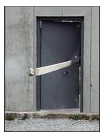
Tornado safe room impact test results: Door assembly failed at latch/lock