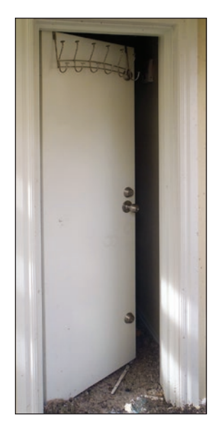
Residential safe room door (Moore, OK, 2013)

Steel doors commonly used in residential and commercial construction cannot withstand the impact of the wind-borne debris, or "missiles," that a tornado can propel, and their failure has resulted in serious injury and even death during